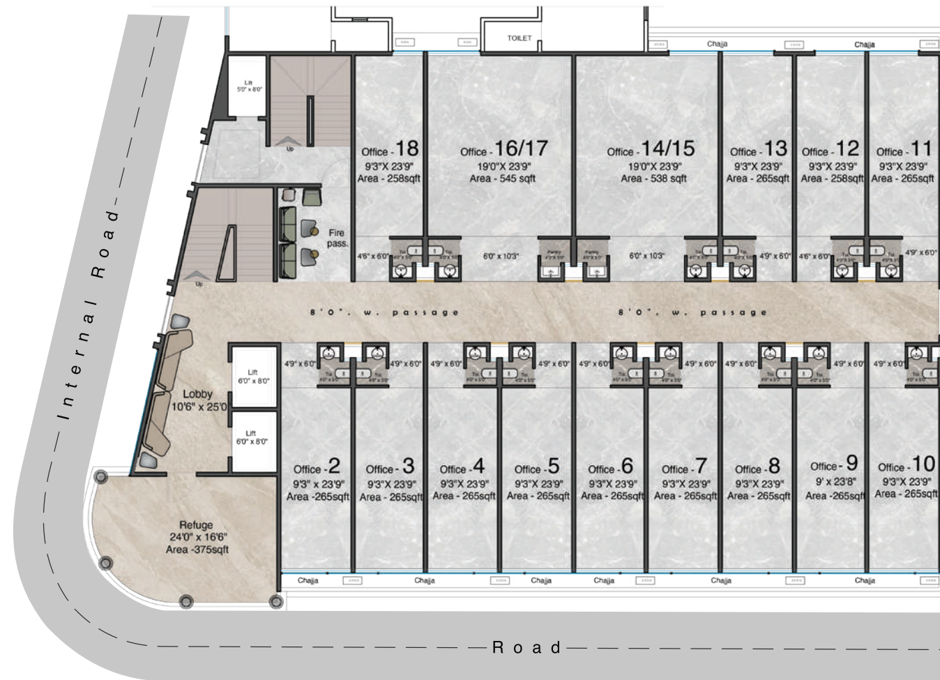
6 TH FLOOR PLAN